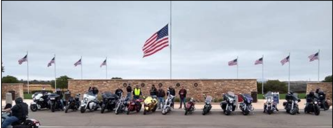
May 29th - Memorial Day Ride